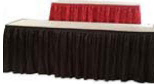
Table Skirt Color: _____ blue _____ red _____ burgundy _____ black _____ green _____ yellow _____ white

(Standard table height is 30in. Add $40 for 40in high skirted table.) (All sizes skirted on three sides. For skirt on 4th side, add $20 on 30in tall table, $30 on 40in tall table)